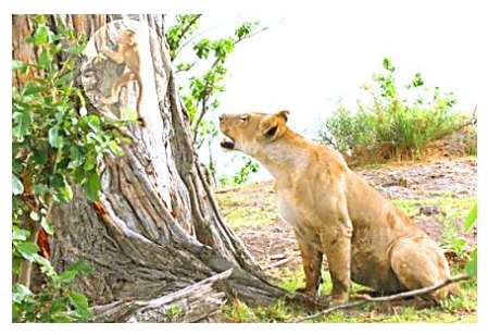
A Baby Baboon Meets a Lioness: What Happens Next is Amazing Deposts