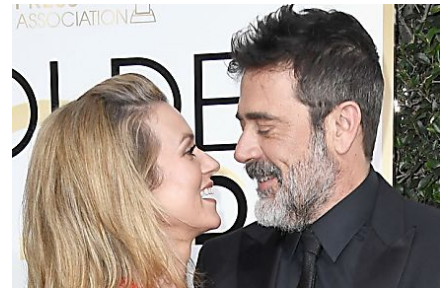
They Gave Everyone Else at the Golden Globes Serious Relationship Envy