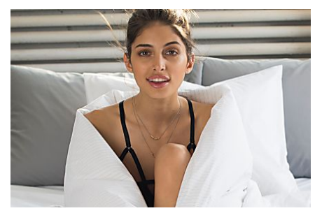
The Absolute Best Sheets You Will Ever Find. Period. Business Insider