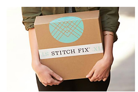
10 Things to Do When You Try Stitch Fix Stitch Fix