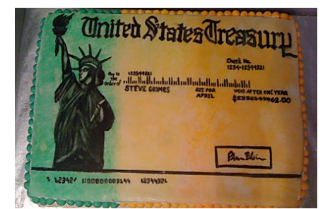
Homeowners Born Before 1985 Get A Huge Surprise