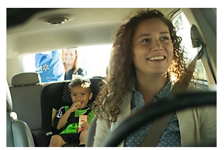
Walmart's Grocery Pickup is Here and People Can't Get Enough -Order Online...